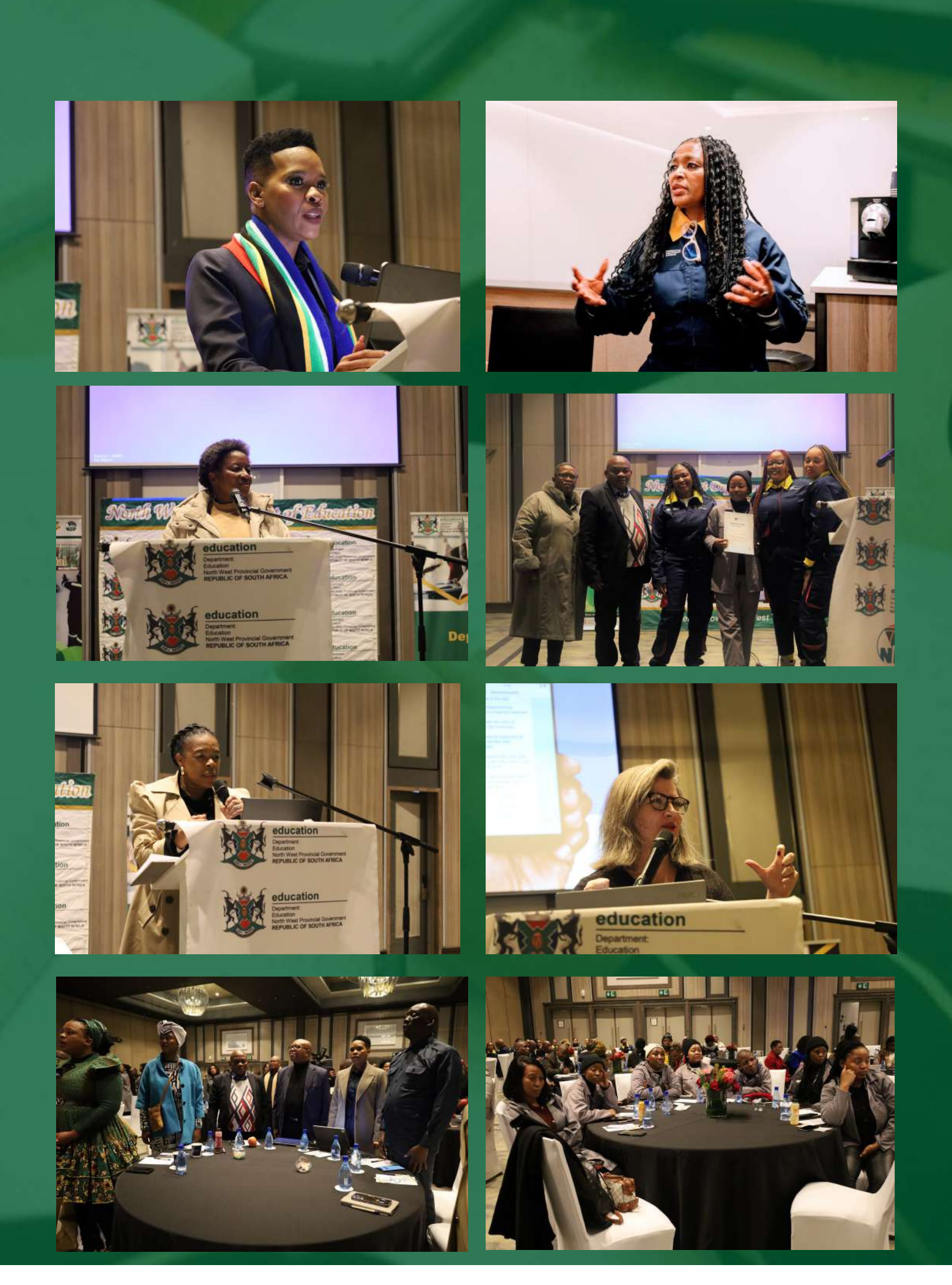
Learner Registration - 08 April - 30 September 2025