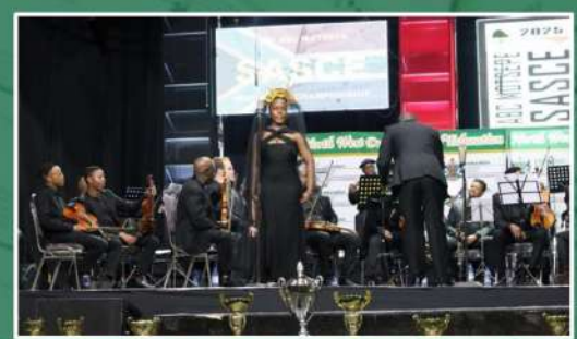
Batswana Secondary School from Ngaka Modiri Molema District - Soprano Solo Category

Results for ABC Motsepe South African Schools Choral Eisteddfod Winners (SASCE) for SECONDARY SCHOOL, Day 2 on 23rd March 2025