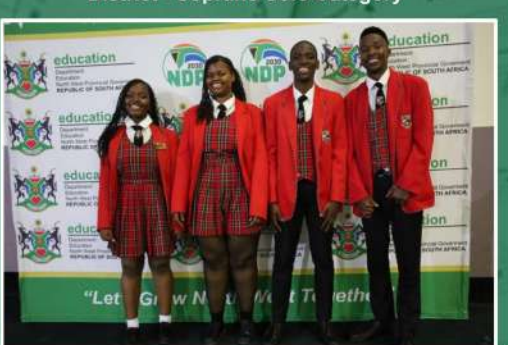
Batswana Secondary School from Ngaka Modiri Molema District - Small Ensemble Category