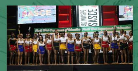
Kebonang Secondary School from Ngaka Modiri Molema District -SSA Choirs Category

Results for ABC Motsepe South African School Choral Eisteddfod (SASCE) for SECONDARY SCHOOL Day 3 on 24 March 2025.