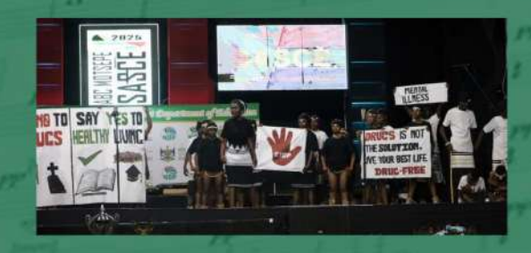
Setilo Secondary School from Ngaka Modiri Molema District - Social IIIs Jingle & Folklore Category