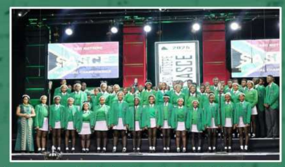
Kebonang Secondary School from Ngaka Modiri Molema District - Secondary B Schools Mixed Choir (Western) Category & - Secondary B Schools Mixed Choir (African) Category