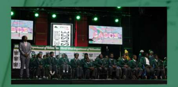
Tlamelang Secondary School from Ngaka Modiri Molema District - Special Schools (MID) Category