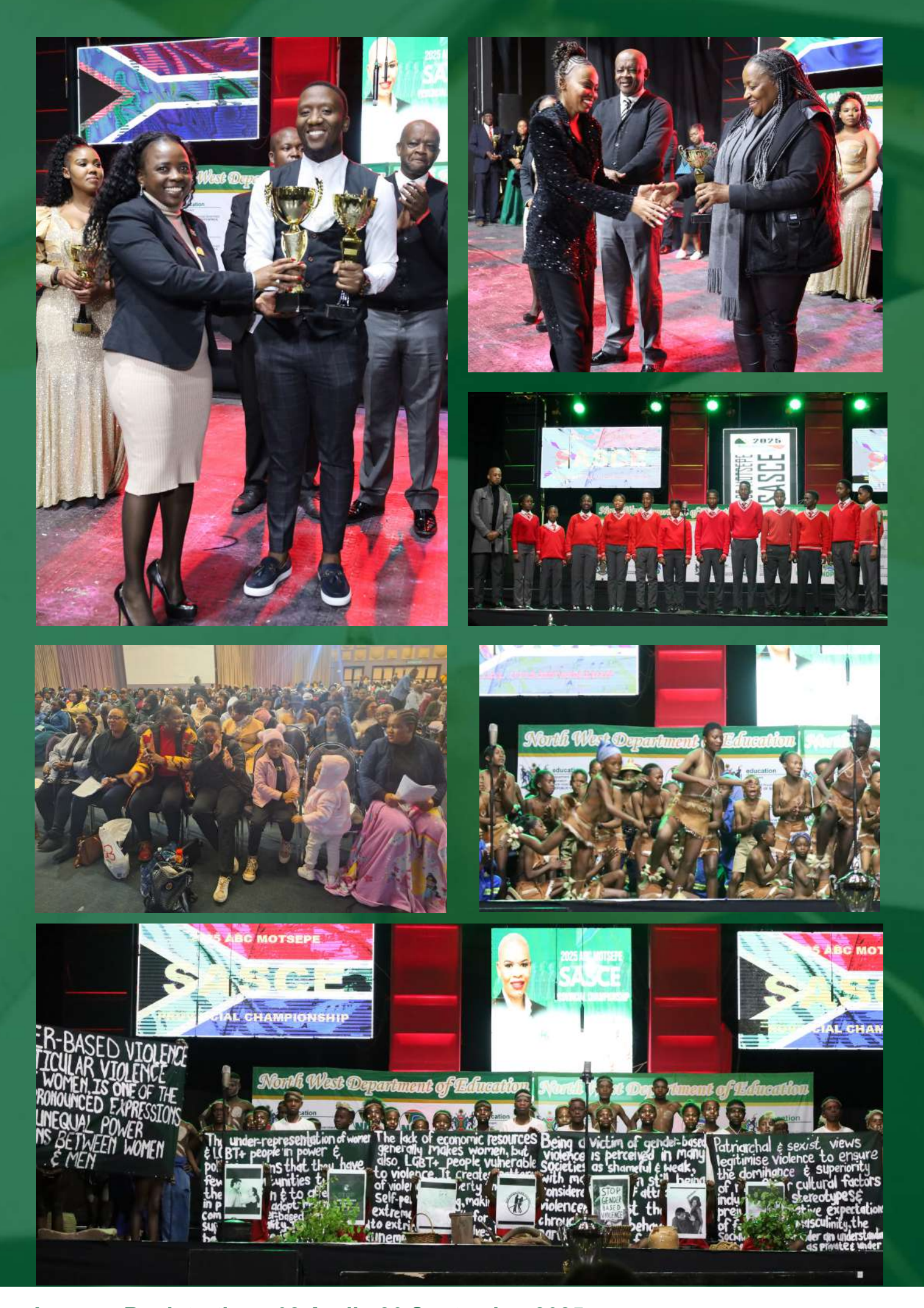
Learner Registration - 08 April - 30 September 2025