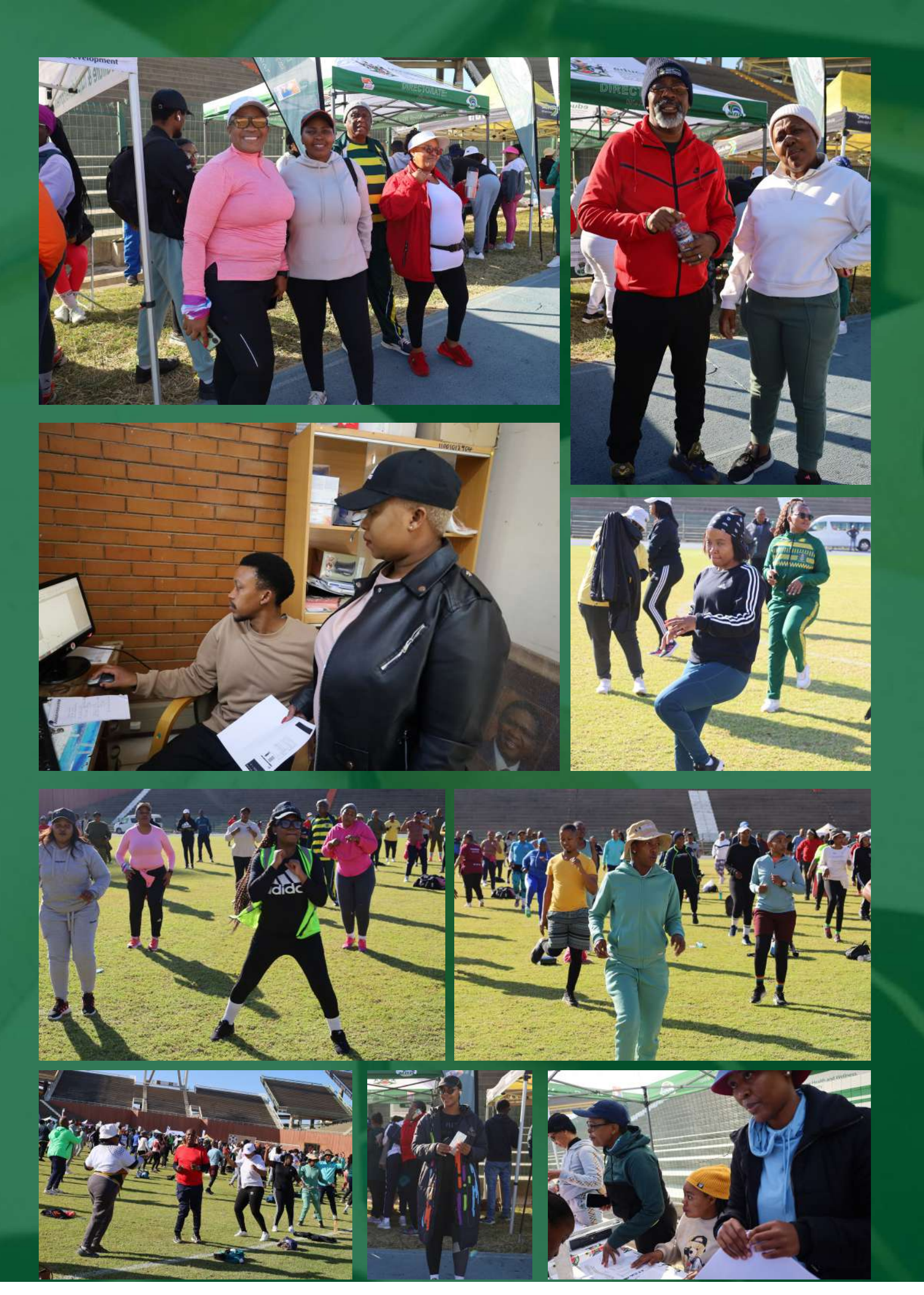
Learner Registration - 08 April - 30 September 2025