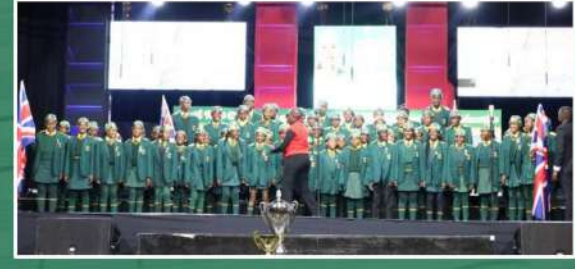
Kgwanyape Primary School from Bojanala District - Mixed Choirs (Western) Category