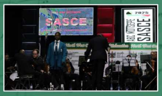
Mothotlung Secondary School from Bojanala District - Mezzo Soprano Solo Category