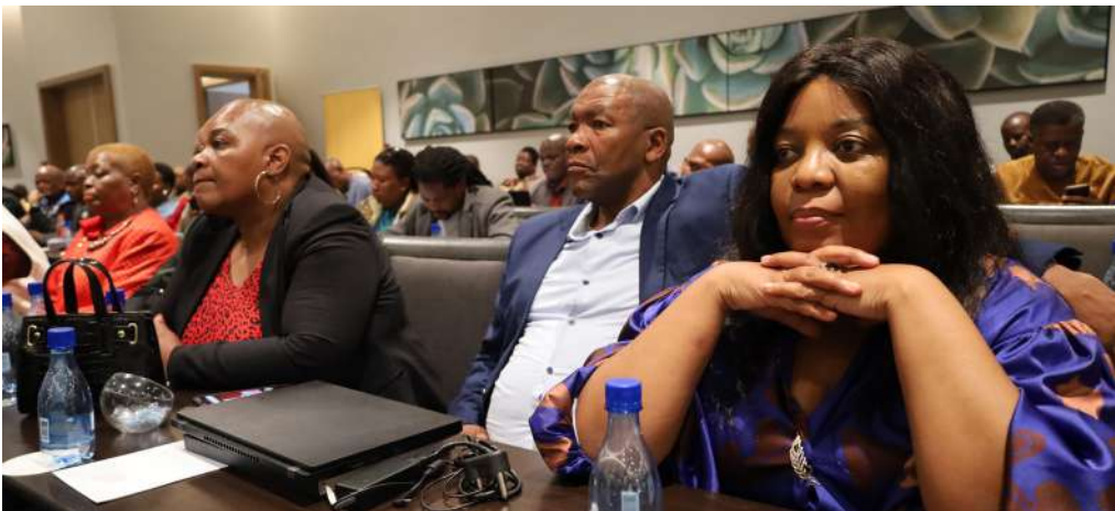
Members of the School Governing Bodies who attended the Back to School Activation Programme.