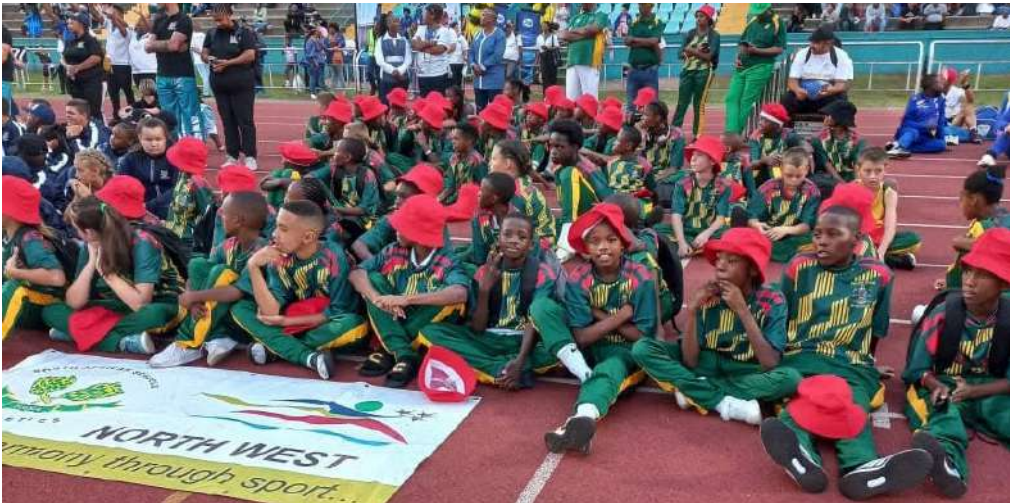
North West Provincial Athletics Team which attended the National Primary Schools Track And Field Championships.

CONTACT DETAILS: DEPARTMENT OF EDUCATION , COMMUNICATION DIRECTORATE ADDRESS: PROJECT CENTRE, 5 AERODROME ROAD, MAHIKENG INDUSTRIAL SITES Email Address: nweducation@nwpg.gov.za Emalindi@nwpg.gov.za Gseatle@nwpg.gov.za