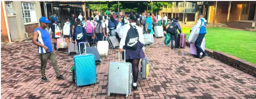
Arrival of the Grade 12 learners at the Autumn Camp held at Oom Paul Special School.