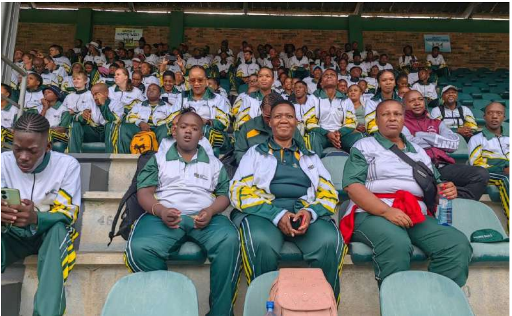
The North West Team.