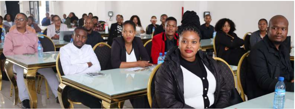
Interns who attended the MEC Interaction Session.