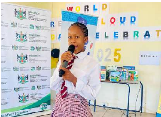
Learners who participated at the World Read Aloud Day.