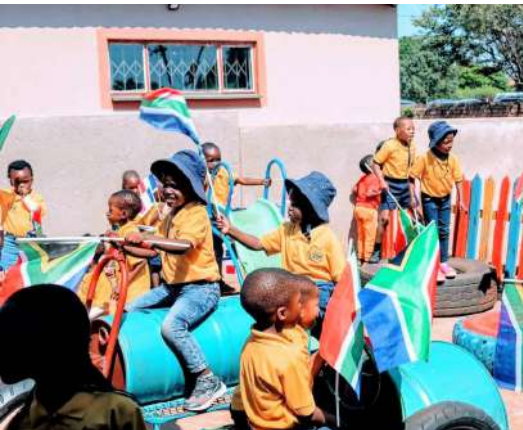
Early Childhood Development learners playing during the visit of the Minister of Basic Education and the France Ambassador.