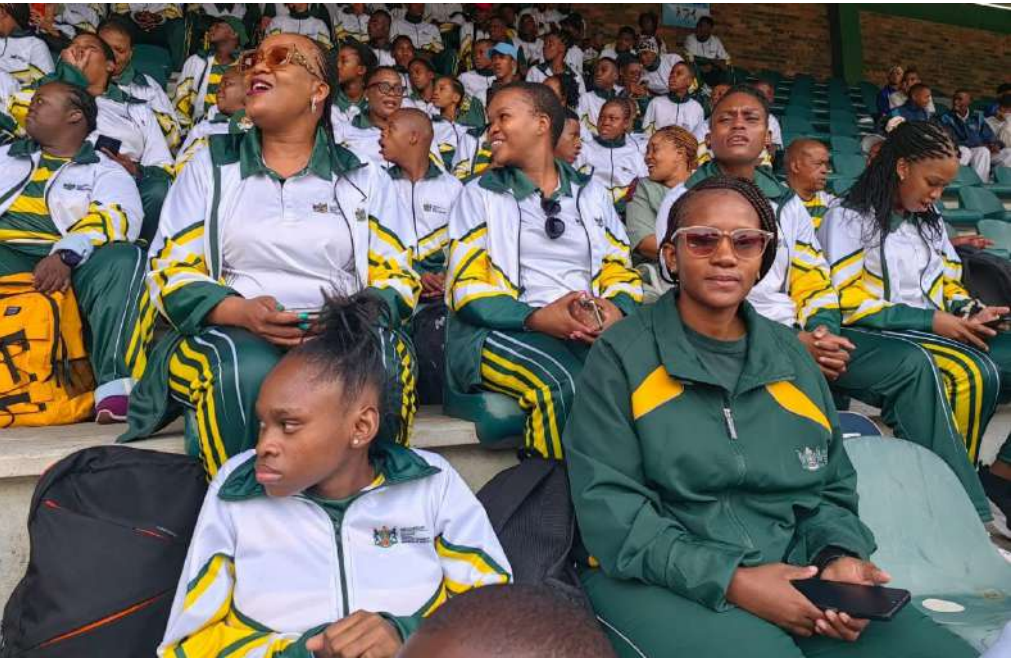
The North West Team.