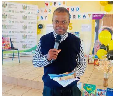
Departmental Official addressing the learners