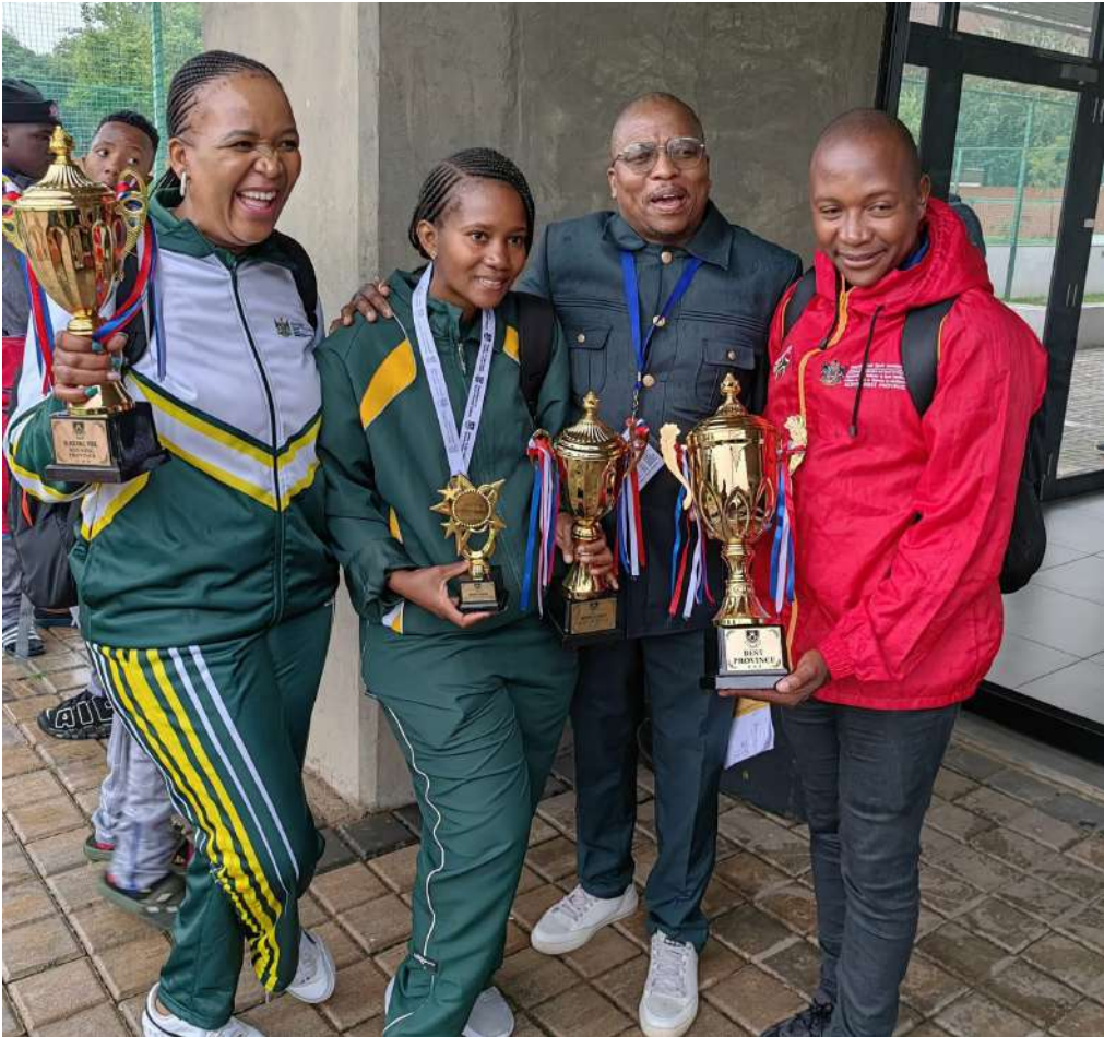
The North West Team in a jubilant mood after winning the SASA II National Championship

The North West Department of Education is working towards achieving the "Vision Education is working towards achieving the "Vision 350" of the South African Minister of Sport, Arts and Culture, which aims to foster a 350" of the South African Minister of Sport, Arts and Culture, which aims to foster a thriving arts, culture, and heritage sector that contributes to sustainable economic thriving arts, culture, and heritage sector that contributes to sustainable economic development and social cohesion.development and social cohesion.