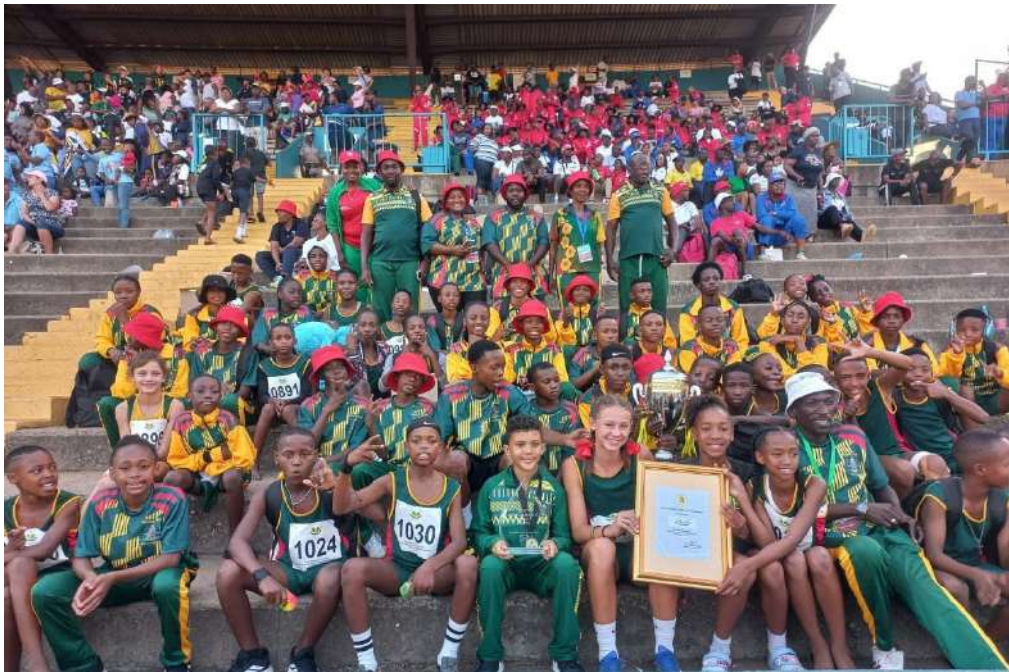
North West Provincial Athletics Team which attended the National Primary Schools Track And Field Championships.

The National Secondary Schools Track and Field Championships are expected to take place in Bloemfontein on the first week of April 2025. take place in Bloemfontein on the first week of April 2025.