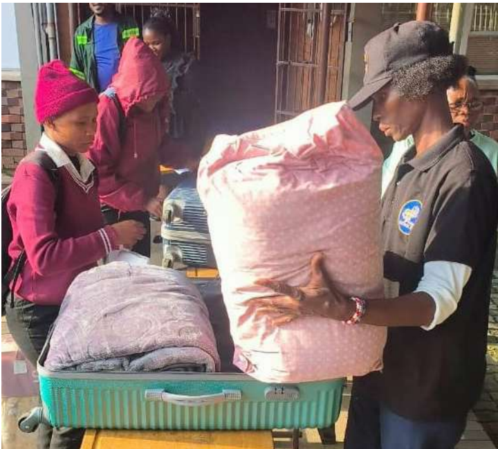
Security checking the bags of the Grade 12 learners during the admission process to the camp.

Their visit started at Tlhabane Resource Centre where they met the departmental officials, then proceeded to Kids Day Care Centre in Lokgalong Village.