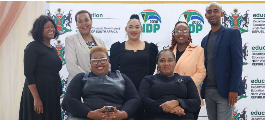
Departmental officials who grace the MEC Interaction Session.

Mec Ntsetsao Viola Motsumi is the first Mec for the North West Department of Education to embark on a face to face meeting with all interns across the province. The MEC met with all interns from Corporate office and four Districts of the department to assure them that the Department is fully supporting them and will continue to offer them the required skills to face the world. the country as well as uplifting their skills through skills development programs of government.