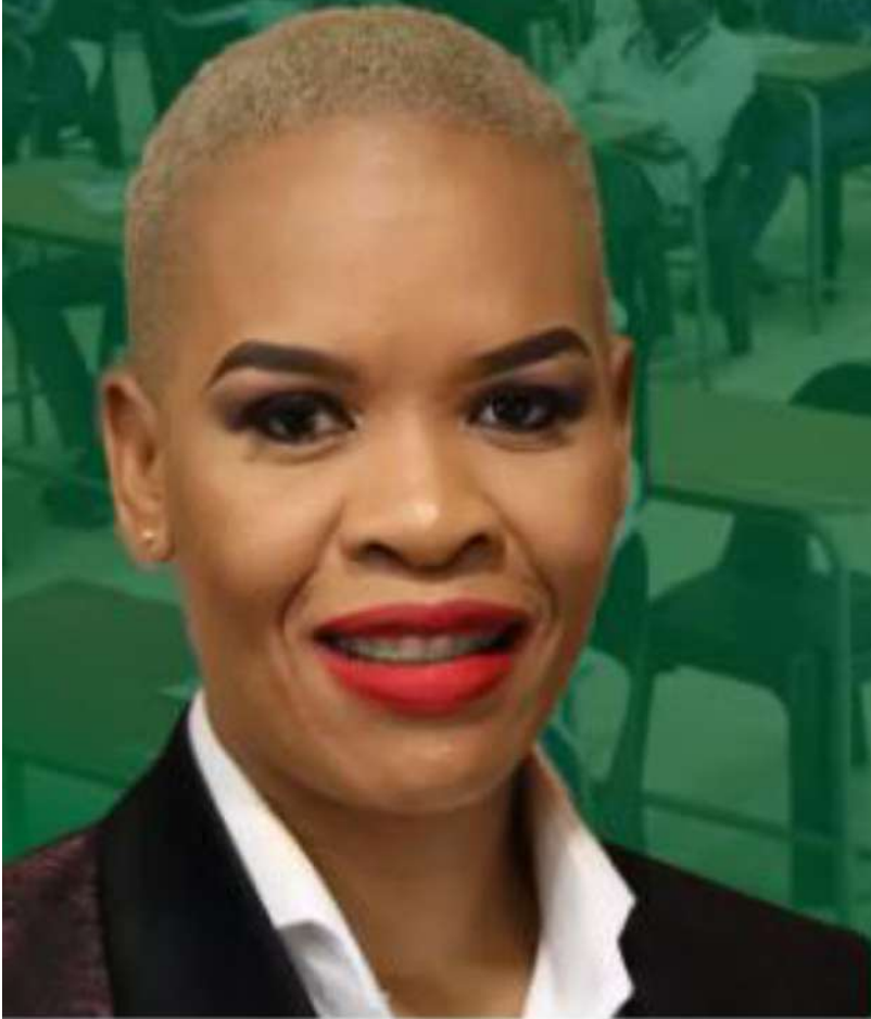
MEC Ntsetsao Viola Motsumi North West Department of Education

For the North West Department of Education