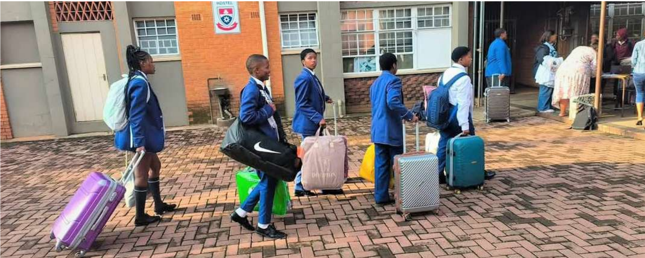
Arrival of the Grade 12 learners at the Autumn Camp held at Oom Paul Special School.

The North West Department of Education has embarked on the autumn camps across the province. These camps are aimed at improving matric results. The camps, which commenced on Friday, 28 March 2025, target underperforming schools, vulnerable schools with pass rates around 70%, and those with progressed learners.