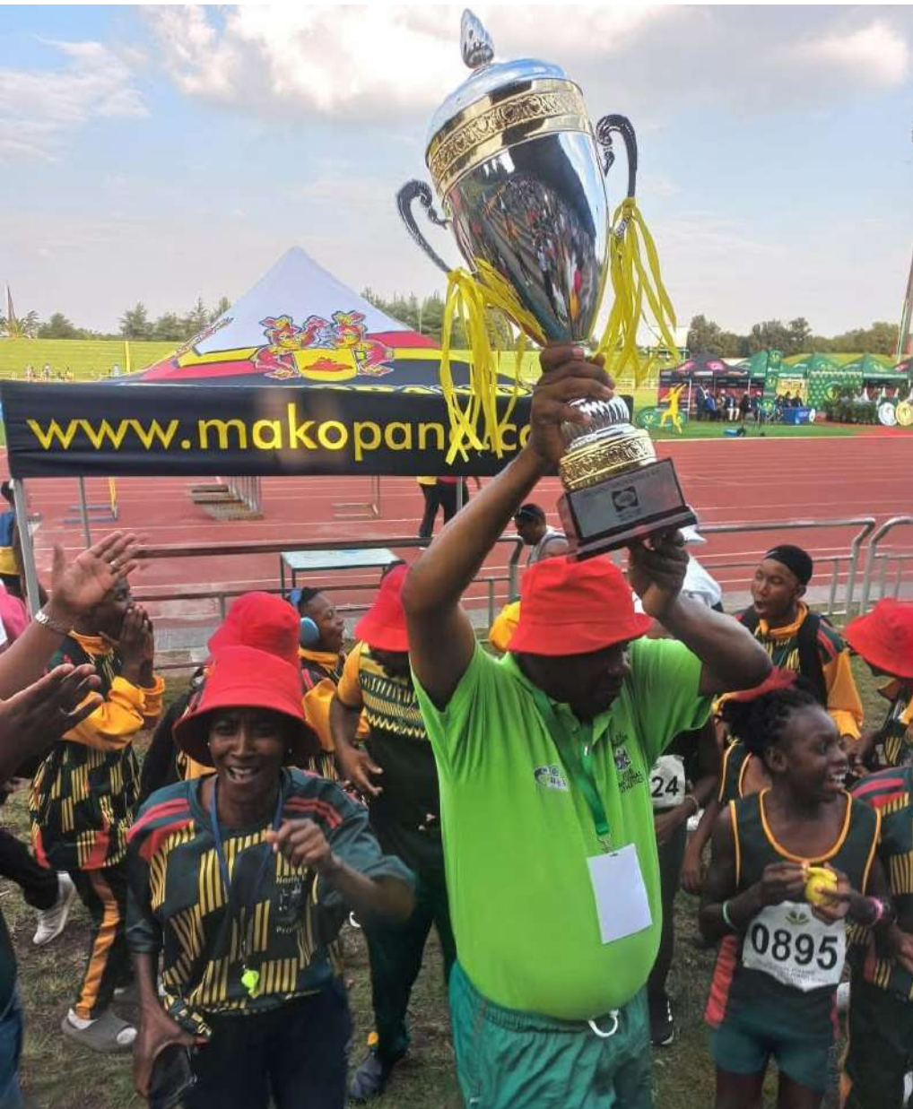
A teacher celebrating the top position obtained by North West Provincial Athletics Team at the National Primary Schools Track And Field Championships.

The North West Department of Education Provincial Athletics Team scooped a third place at the National Primary Schools Track and Field Championships, held at Germiston Stadium from 20 to 22 March 2025