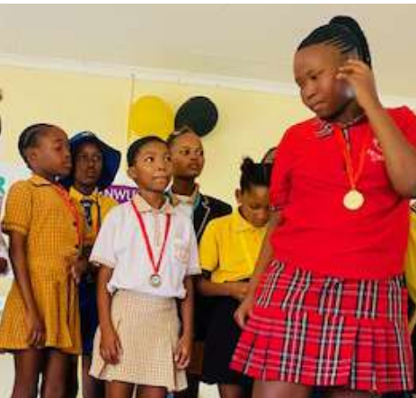
Learners who participated at the World Read Aloud Day.