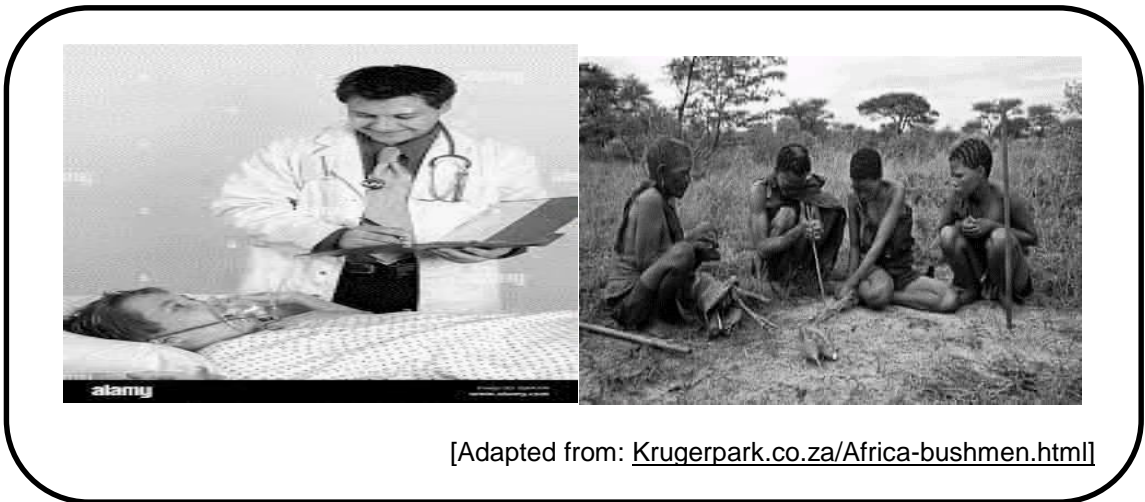
[Adapted from: Krugerpark.co.za/Africa-bushmen.html ]

4.2 Write a paragraph of 5–6 lines to differentiate between Indigenous healing and Western medicine. Topic sentence and main points to be included. (5)