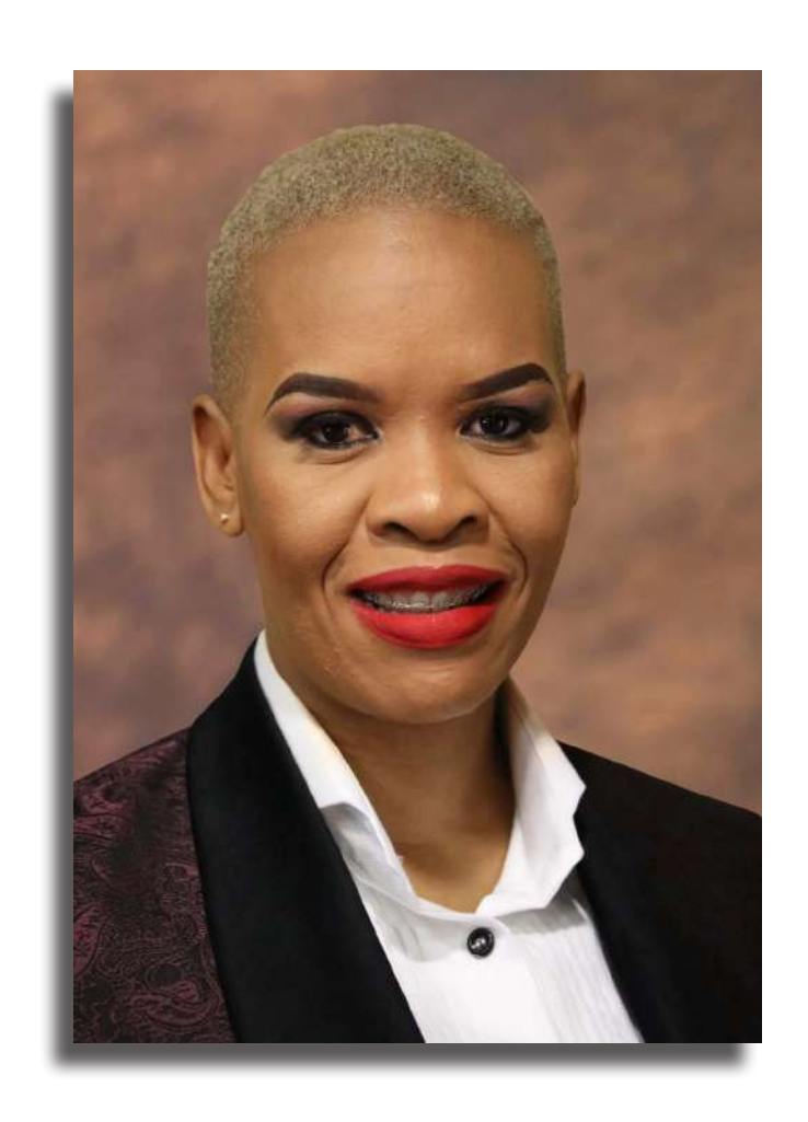
Ntsetsao Viola Motsumi North West Education MEC

As our learners undertake their National Senior Certificate (NSC) examinations, we express confidence that the cohort of 2024 will rise to the challenge. With the unwavering dedication of our educators, the steadfast support of parents, and the relentless commitment of our learners, the North West is poised to achieve an admirable pass rate ranging from 86% to 90%. We encourage all to approach these examinations with courage, faith, and determination.