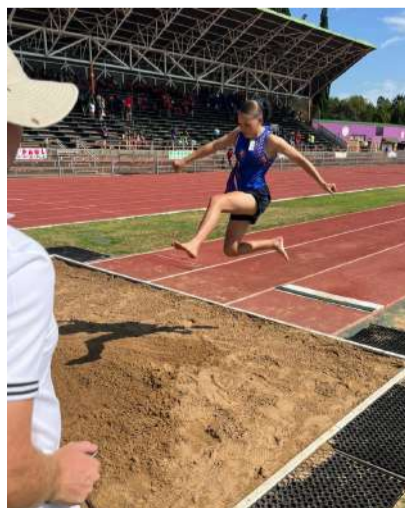
A learner participating in a Long Jump