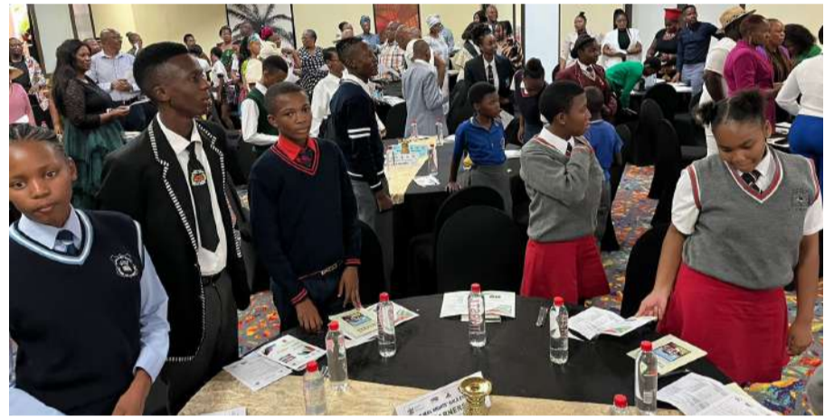
Learners from different schools who attended the Human Rights Day event