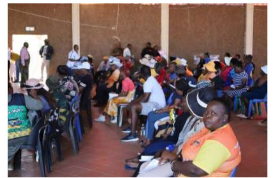
Parents of learners who attended the meeting to introduce the contractor