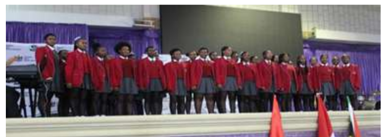
School choir performing for the audience during SASCE music competition