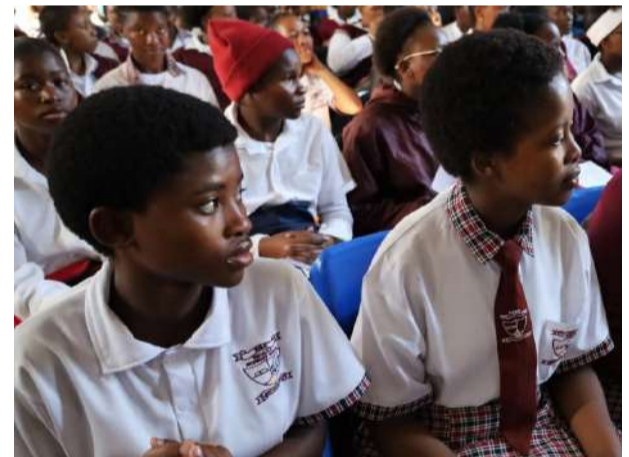
Learners who attended the Career Expo