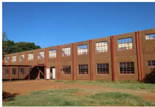
A block of classrooms which were affected by the storm