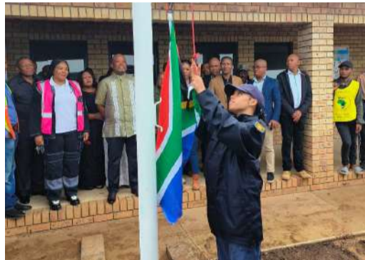
A member of the South African Police Service hoisting the flag during the Saruchera Secondary School handover