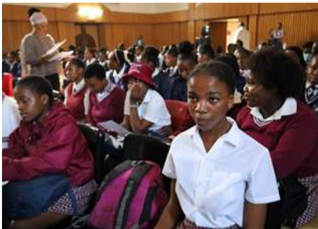
Learners who attended the Career Expo