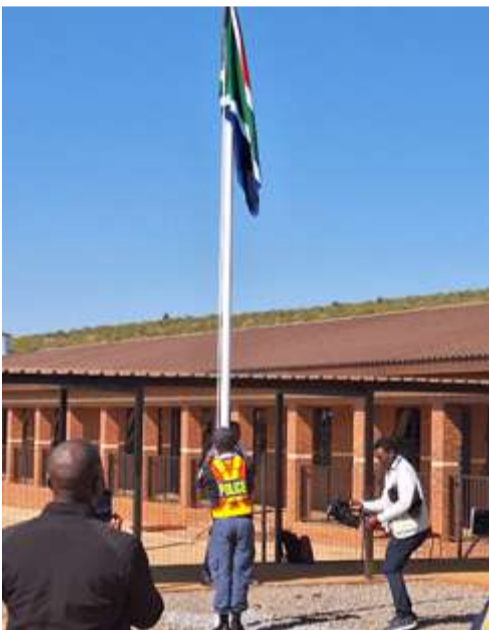
Hoisting of the flag by SAPS