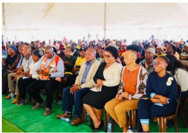
Middle: Members of the community who attended the Sod-Turnig ceremony as Ipelegeng Township