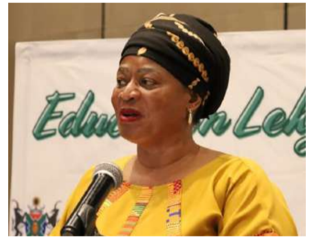
Deputy Minister for DBE, Dr Reginah Mhaule addressing the audience during the Education Lekgotla held in Sun City