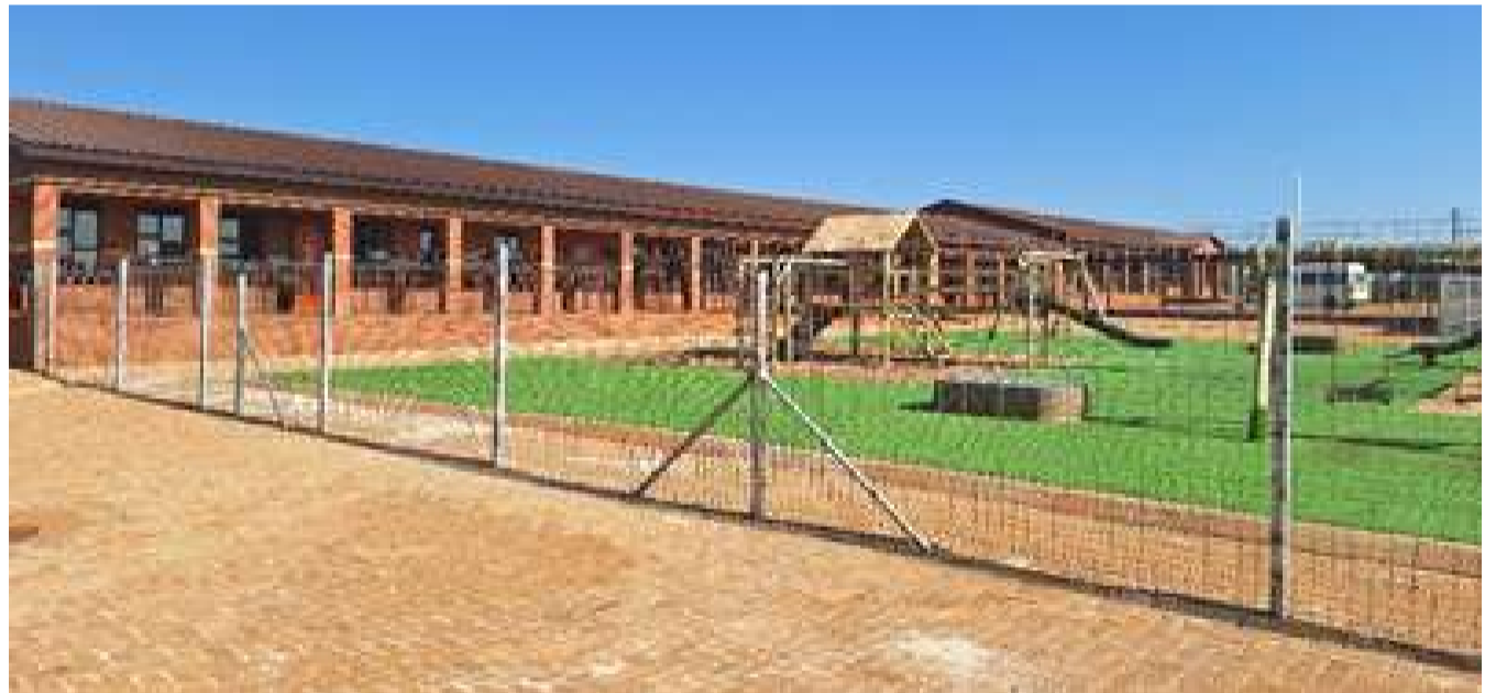
Grade R Block at Monnamere Primary School in Dinokana Village