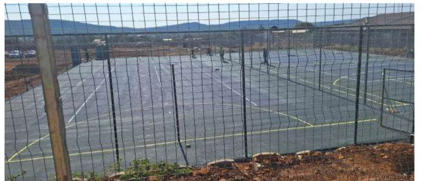
Combi court for the learners