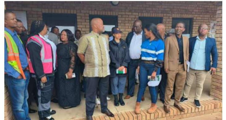
Acting Premier, Nono Maloyi and MEC Viola Motsumi observing the hoisting of the flag at Saruchera Secondary School