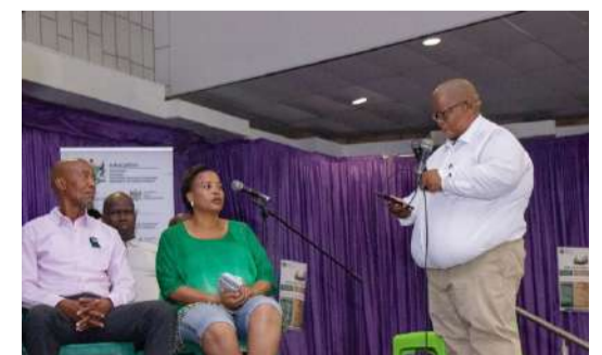
Departmental officials demonstrating to the audience on how the elections will be conducted