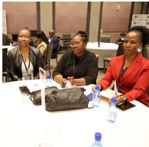
Business Stakeholders who attended the Education Lekgotla at Suncity