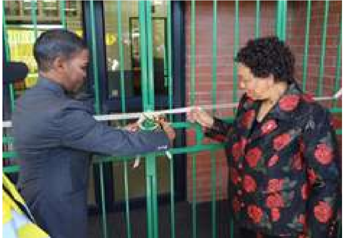
MEC Viola Motsumi and Minister Angie Motshekga cutting the ribbon at Goakganya Primary School in Phasha –Maloka Village

This system led to the birth of the National School Nutritional Programme (NSNP) that is ensuring that 9.6 million learners are being served with breakfast and lunch in schools. “The total amount of 9 billion is been spent by our government to feed 9.6 million learners on daily basis. All Learners in Quintal 1 to 3 schools are receiving free education”.