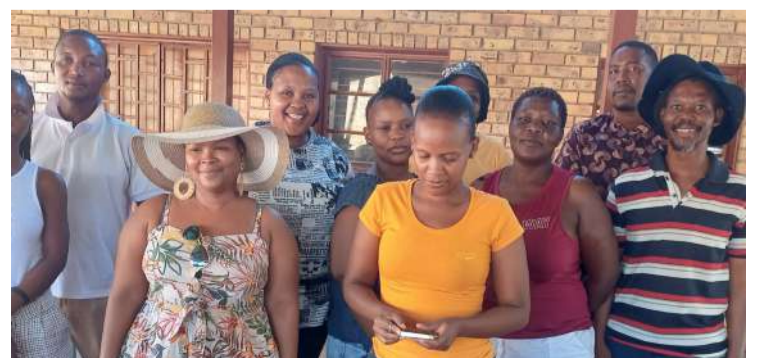
A newly elected SGB committee for the Mankuroane Technical and Commercial School