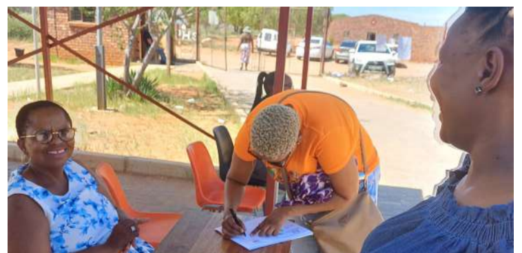
Parents voting during the SGB elections