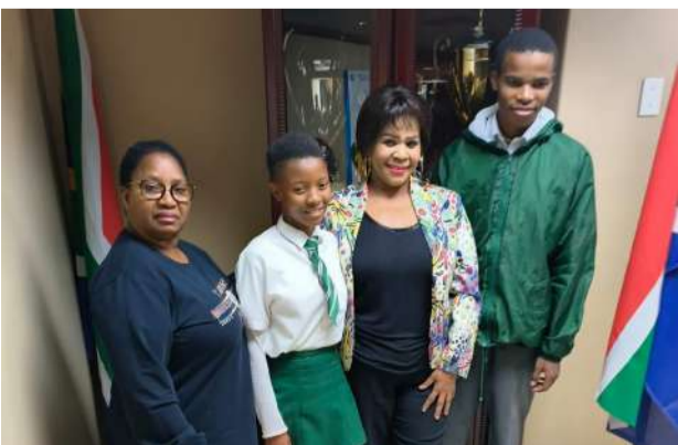
Staff from the Superintendent General Office together with the learners who took part in the "Take a child to work campaign"

The North West Department of Education through the Special Programmes Unit hosted forty (40) learners doing Grade 8 – Grade 11, from schools within the Ngaka Modiri Molema District, on the 9 – 10 May 2024 at their Head Office in Mafikeng as part of the Take a Child to Work Campaign.