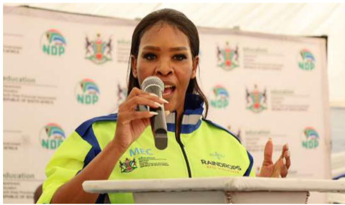
MEC Viola Motsumi addressing the communities in Morokweng Village