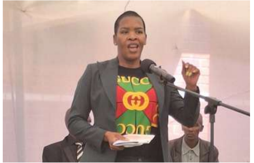
MEC Viola Motsumi addressing the Dinokana community during the handover of Dinokana Primary School

The MEC for Education, Ntsetsao Viola Motsumi expressed her commitment and gratitude to deliver services to the North West Communities, during the handover ceremony. She pleaded with the community to take care of the school and ensure that it becomes a generational treasure to the people of Dinokana and the surrounding villages. She also expressed her happiness to note that the building of the school created job opportunities for some of the community members. A total number of 260 people were employed during the project construction period, which amongst other included Women, Youth and SMMEs.