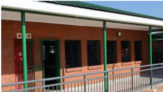
A block of classrooms handed over by Minister Motshekga and MEC Motsumi

As part of the plan, the government came with strategic plans that will strengthen the quality of education in South Africa as many learners were dropping out due to circumstances that were beyond their control. School uniform, school fees, hunger, monthly periods, dilapidated infrastructures were highlighted by the minister as contributing factors that led to the reduction of school attendance. The 10 point plans ensured that all learners have the right to basic education as their constitutional right.