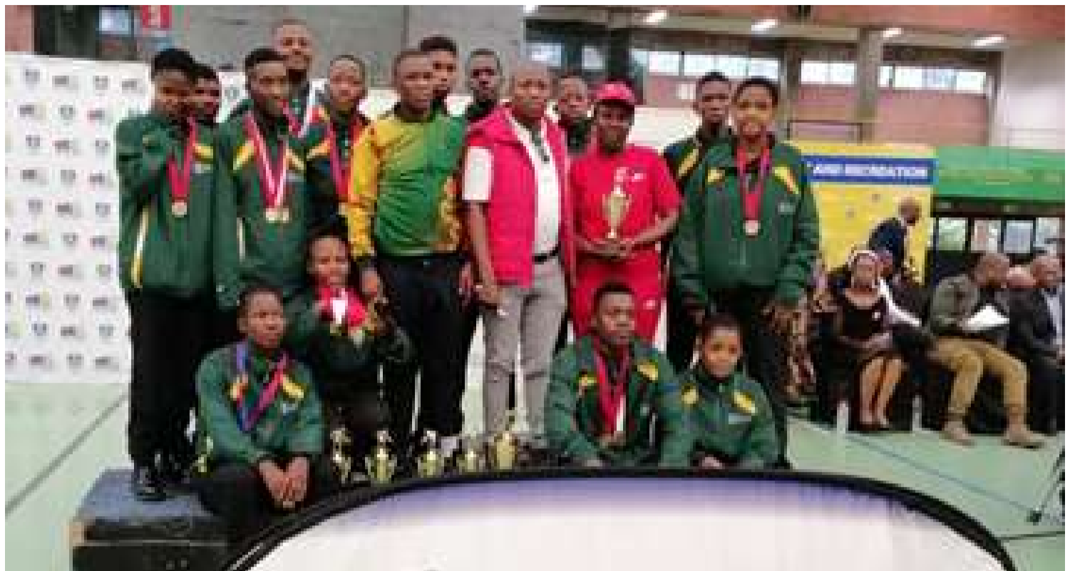
Learners displaying their medals during the National SASA-II Games