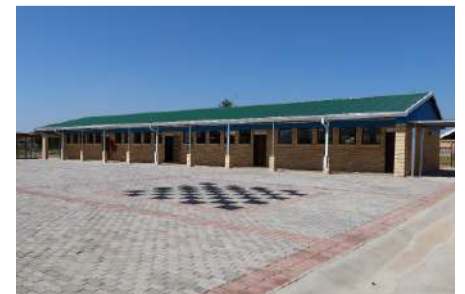
A block of classrooms at Relebogile Primary School