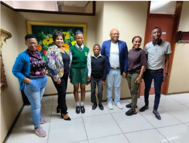
Staff from the Office of the MEC and the learners who participated in the "Take a child to work"