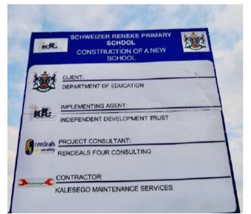
Middle: Construction Board unveiled by MEC Viola Motsumi