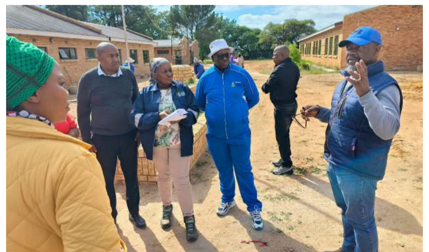
The Social Cluster MECs visited D.P. Kgotleng to monitor construction progress of DP Kgotleng Primary School