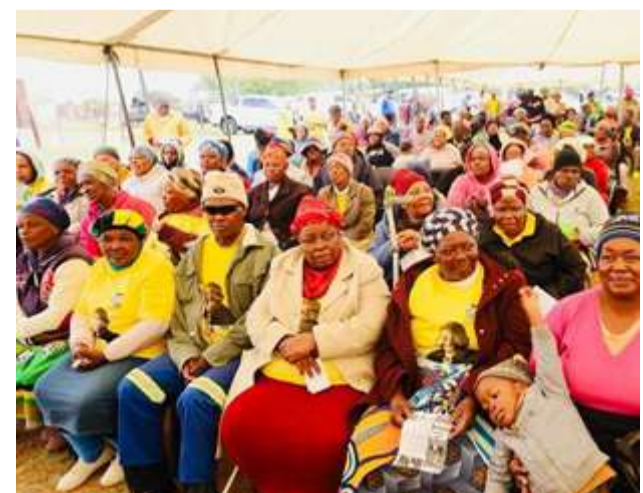
The Mareetsane community that attended the Sod-Turning ceremony