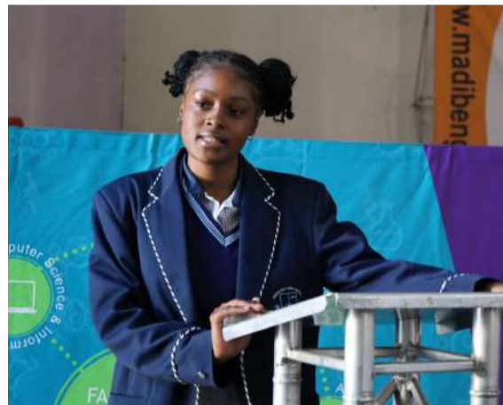
A learner giving her experience about the Career Expo