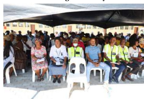
Parents who attended the handover event