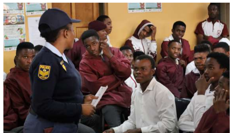
A SAPS member addressing learners on the dangers of crime

A child parole officer from the Department of Social Development was also present to make the learners aware of life as a child offender. These officials were relevant in this dialogue as the learners commit crime, use substance and are part of gangs in school. The learners engaged with the officials on all issues that affected them.