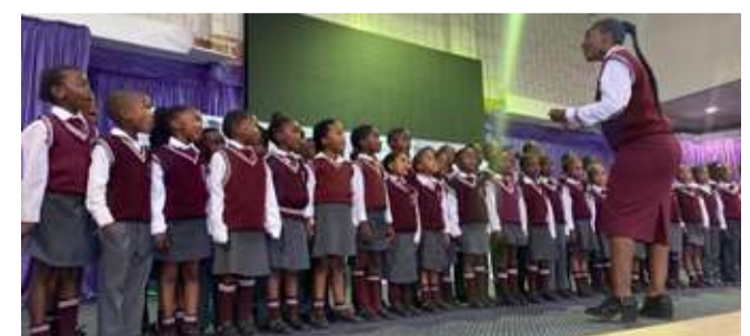
School choir performing for the audience during SASCE music competition