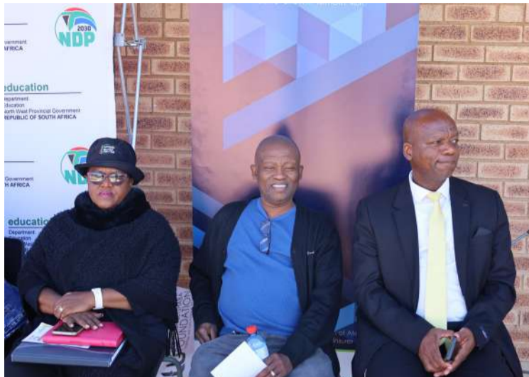
Departmental Officials who attended the event

This is the main reason why he decided to come back to the same school years later to give learners who come from disadvantaged backgrounds shoes in order to elevate their dignity.