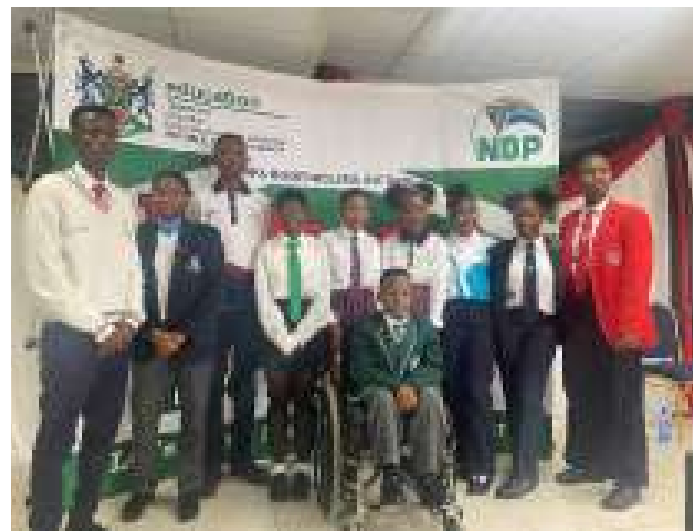
Performing candidates of Mafikeng LEO