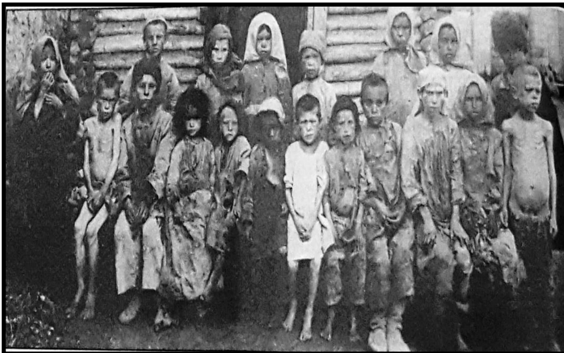
History by C Culpin]

The photograph below shows starving Russian children as a result of War Communism.