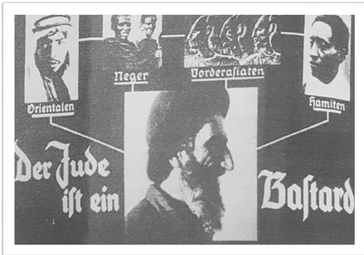
[From The Nazi Era: Racial Policies ]

This frame from a Nazi film strip, that was made to be shown in schools, shows that their racial hatred was not just directed at the Jews. The caption reads “The Jew is a bastard”. The image was meant to link Jews to other groups deemed inferior – eastern peoples, blacks, Mongols and east Africans.